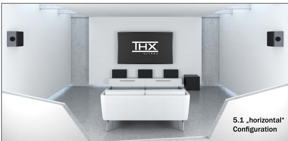
5.1 „horizontal“ Configuration

Thanks to its small dimensions and its versatility, the Cinema Ultra allows for numerous configurations. THX® already approves of the minimum configuration of a 5.1 set (top left). But many movie connoisseurs will surely demand more. A second subwoofer will add the extra bass punch to their home cinema, additional surround dipole speakers or even LCR speakers in the rear transform the Cinema Ultra into a highly capable 7.2 system (mid left).