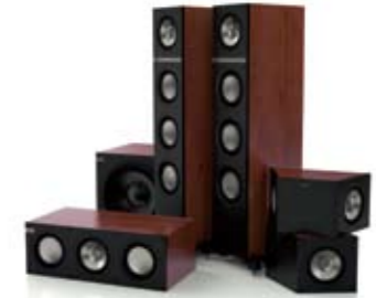
Q500 5.1 Package.