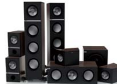
Q700 7.1 Package.