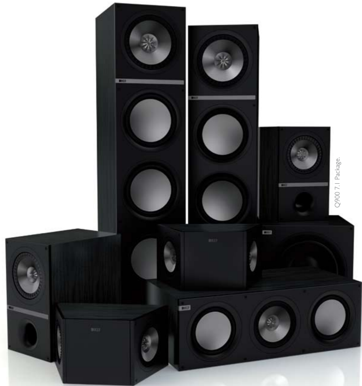
Q900 7.1 Package.