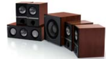
Q100 5.1 Package.