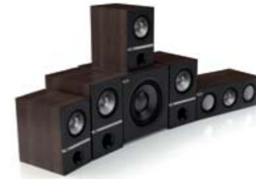
Q300 5.1 Package.